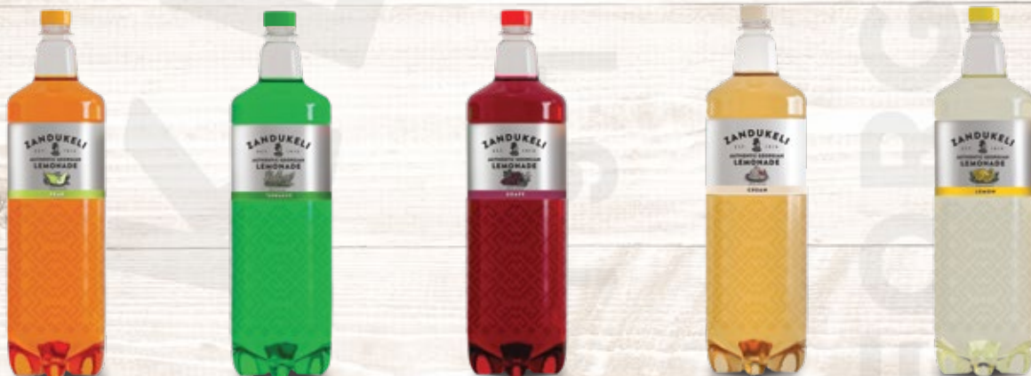
1.5 L PET

Today the enjoyment of lemonade still sits at the heart of Georgian culture. Happily, these days Niko's refreshing flavours of lemon, pear, Saperavi grape, tarragon and cream, are available in supermarkets, bars, cafes and restaurants. With five delicious flavours, there's a lemonade for every occasion and for every palate.